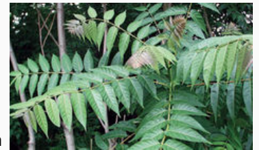
Tree of heaven

The invasive Tree of heaven ( Ailanthus altissima ) is the Spotted Lanternfly's preferred host tree. A host tree is a target tree that provides the insect with nourishment and support during all, or some, of its life stages. However, the egg masses have been found on outdoor furniture, pallets, cars and on houses. Become familiar with what they look like and destroy the egg masses before they hatch into nymphs in the Spring by scraping them off. After the eggs hatch, you will find emergence holes on the masses where the nymphs crawl out. They are black and white spotted and then turn to red and white spotted.