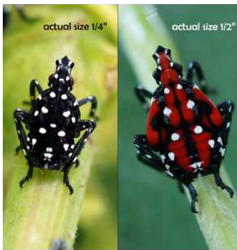
First to Third Instar (May through July)

The invasive Spotted Lanternfly (SLF) nymphs, Lycorma delicatula , are about to emerge from their winter slumber. You will see these little black and white-spotted insects everywhere as they hatch. No need to report them to authorities, the SLF, has already invaded our area. Help decrease their numbers and SQUASH, STOMP and destroy these invasive species from Virginia's landscape.